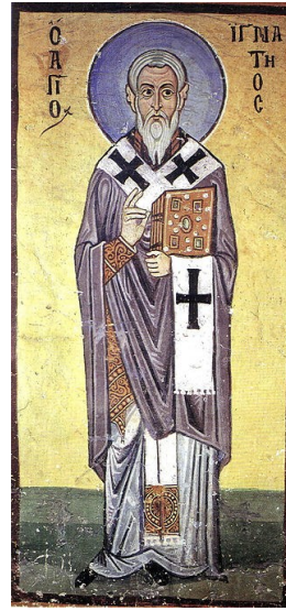
Ignatius of Antioch Early 2 nd Century AD