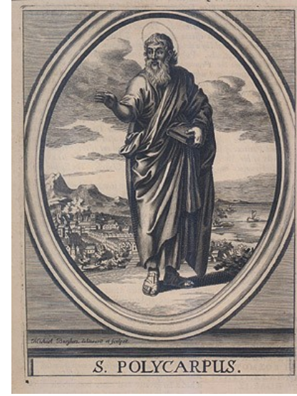
Polycarp of Smyrna c.69 – c.155 AD