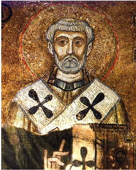
Clement of Rome (Philippians 4:3) c.35 – 99 AD