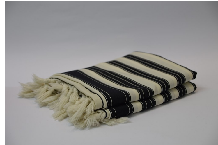
The tallit, a Jewish prayer shawl. Wikipedia