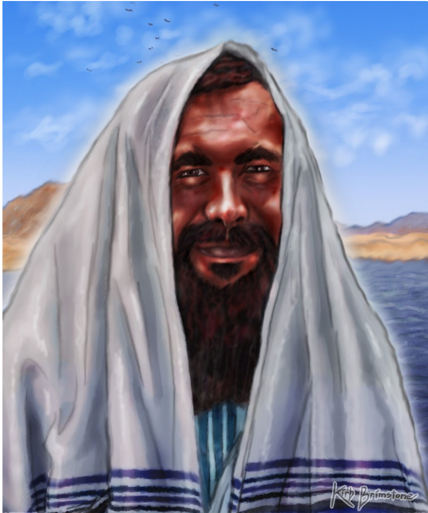
Yeshua, by Kirb Brimstone